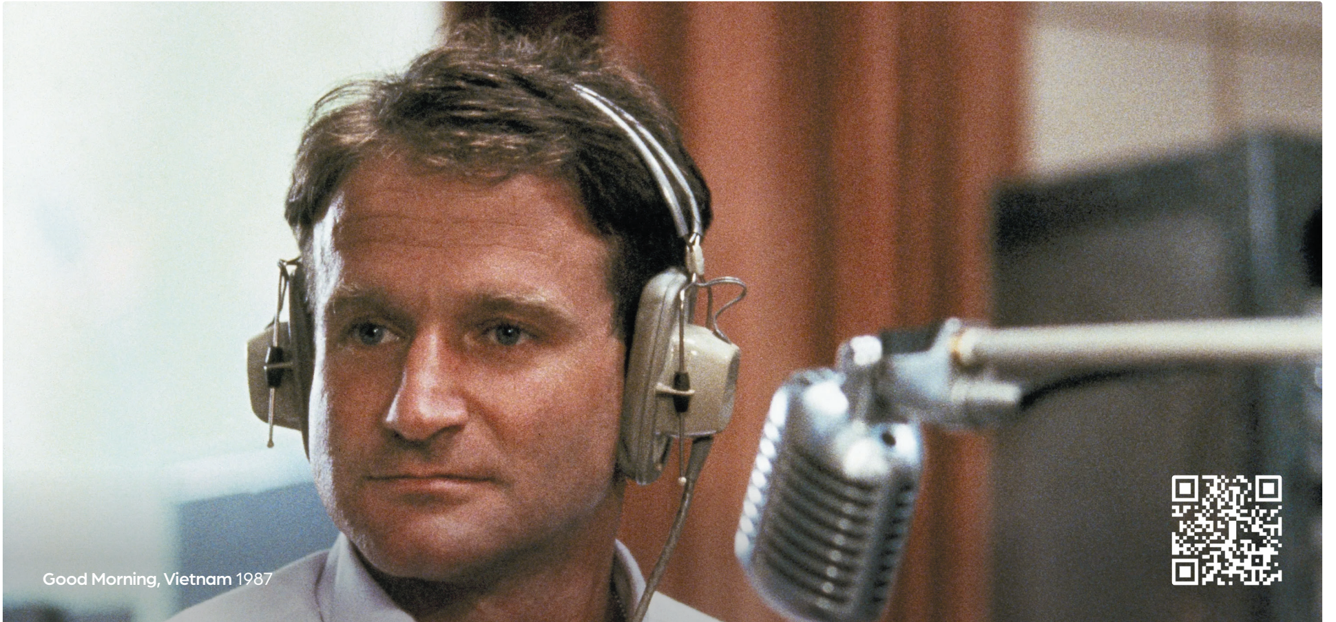
Good Morning, Vietnam 1987